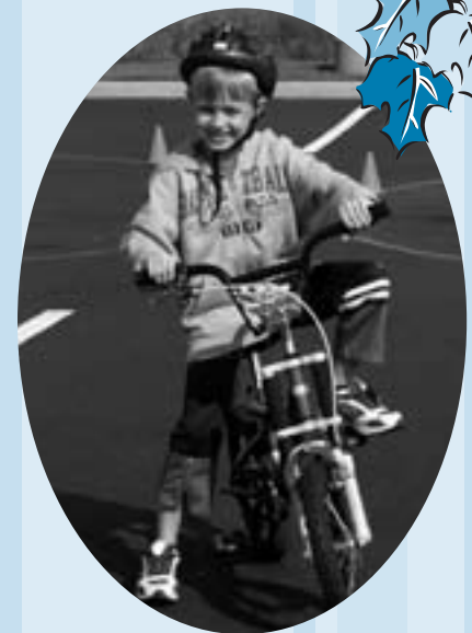
"Bike Rodeo Action" Friend & Family Bike Fest