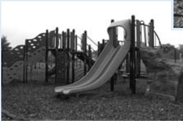
Double Swish Slide at Goodrich School