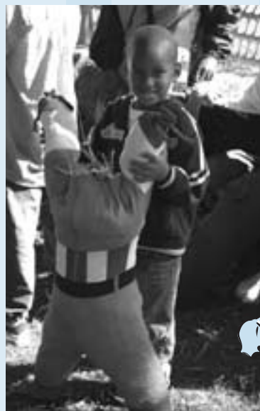
"My Hero" Indian Summer Festival