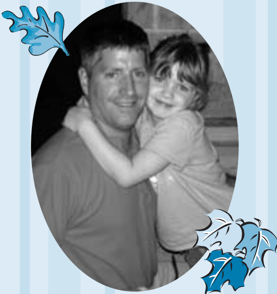
"One More Hug" Daddy/Daughter Hayride