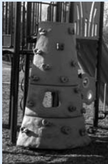
Volcano Climber at Sunnydale Park