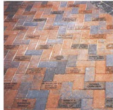
Engraved Paver Example